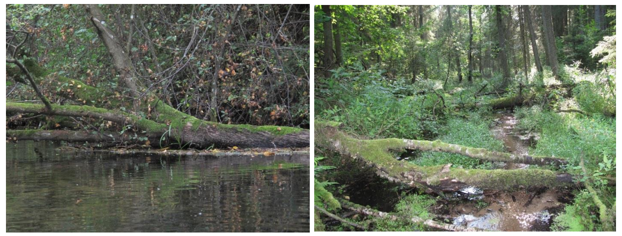
Woody debris in a river

The scope of work needed to create a WBZ depends mainly on the geomorphological conditions and the current degradation status of the river and riverine landscape. To restore wetland banks along a moderately degraded river, the placement of some tree trunks or stones in the riverbed would usually suffice. However, if the river was highly regulated and the riverbed is deeply incised, some (retention) sluice gates should be built to reduce water flow and cause enough inundation of riversides to allow for the development of wetland banks.