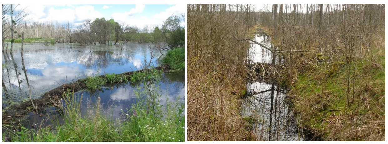
Beaver dams on small rivers: left picture – beaver dam on a small river and resulting floodplains; right picture – beaver dam and resulting wetland banks alongside a ditch, photo Ł. Kozub

The best allies in the creation of wetland banks and floodplains are beavers, which build small dams on rivers, canals, and ditches.