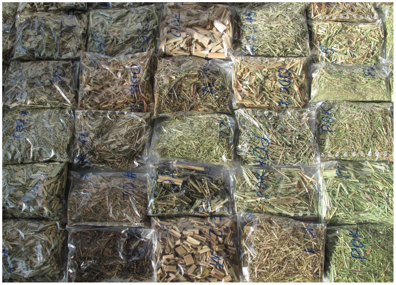
Samples of dried and cut biomass from different types of wetland vegetation

Wetland plant biomass can be used for several products or production chains. Some are already implemented on the market, but in the future, more possibilities can be tested to transfer knowledge from production chains that already exist for comparable biomass types like straw, grass, and wood.