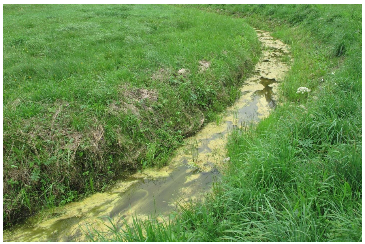
Algal bloom in water in a small stream

phosphorus. One group of organisms traditionally classified as algae are cyanobacteria (or bluegreen algae). Many of them have the unique ability to fix atmospheric molecular nitrogen dissolved in water. We will come back to this fact later, describing the course of eutrophication (nutrient overload) in aquatic ecosystems.