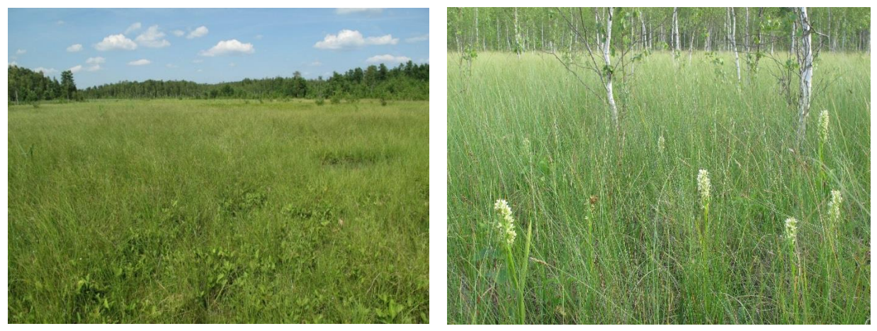
Undrained fens (Rospud valley, Biebrza valley)

5. Rewetted fen – Fens that have been drained and have the upper part of their peat deposit mineralized and turned into 'moorsh' soil can be treated as WBZ only after rewetting, which reduces their carbon and nitrous oxide emissions and re-establishes conditions for denitrification<sup>1</sup>. Only sites with water levels close to the peat surface (or above) for most of the year can be classified here. Caution should be taken because rewetting of drained peatlands can cause a release of phosphates from decomposed peat<sup>2</sup>.