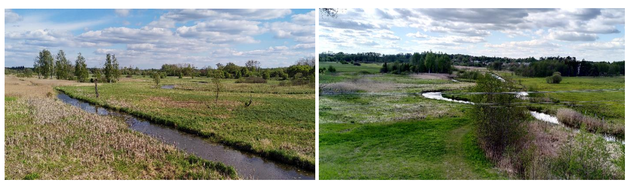
Narewka river (PL): left picture – restored re-meandered section in the background, old straightened section in the foreground, right picture – restored re-meandered section; photo J. Gornia

3. Meandering channel – A section of naturally meandering or re-meandered river can act as a WBZ towards the lower section of the river or another river of a higher order.