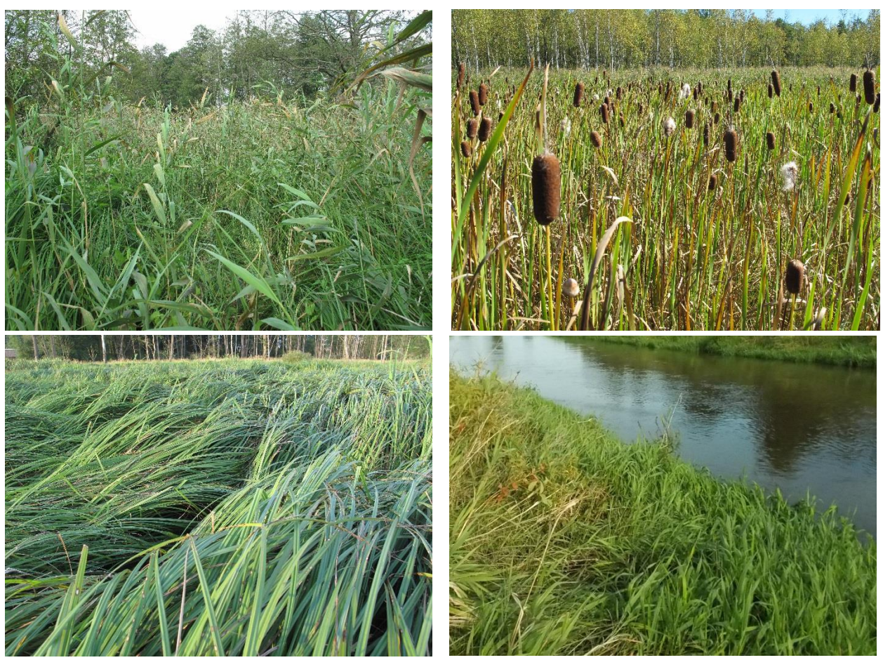
Common reed, cattail, sedges and reed canary grass can build persistent monodominant stands with high yields under wet conditions