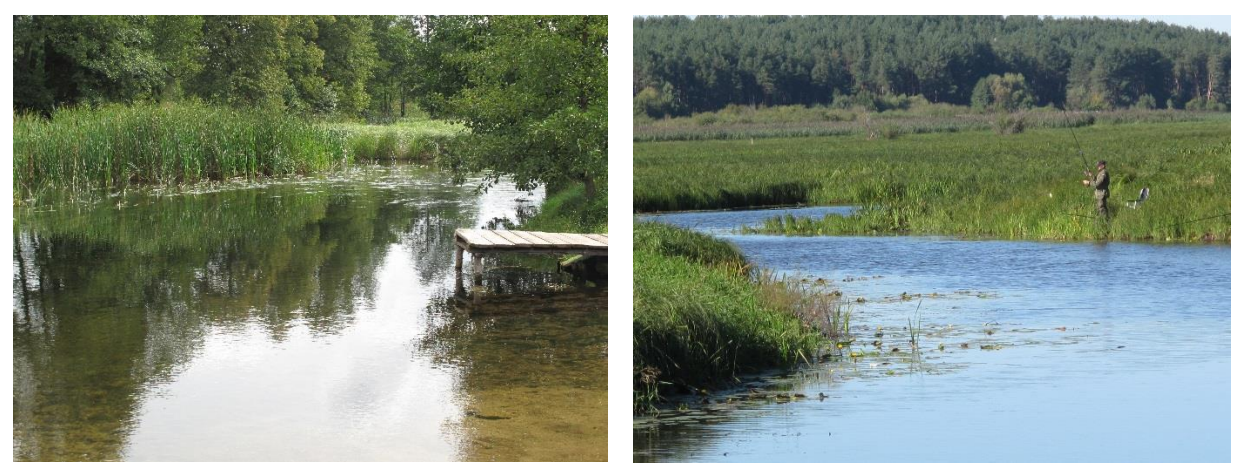
Riverside recreation places

It seems that wild-looking rivers are simply attractive for people, whereas the respondents in three Baltic Sea countries possess good knowledge about small rivers, their current state and restoration prospects, riverine ecosystem services, and perhaps more generally – about the urgency to mitigate the accelerating environmental crisis.