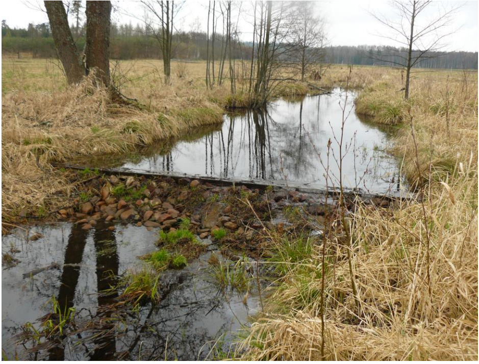
A simple weir, photo Ł. Kozub

To rewet a drained fen mainly damming of existing drainage network is needed. Ditches may be blocked by building new weirs or simply by stacking sandbags with sand or other sediment material, e.g. gravel.