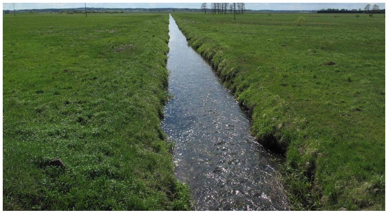
Straight channel excavated across a drained peatland

The pressure of intensive agriculture virtually erased from the landscape most areas deemed unproductive – such as various types of wetlands, and the vast majority of rivers have been regulated, turning meandering watercourses into straight channels. The peatlands were cut with networks of drainage ditches and transformed into hay meadows or arable fields reaching directly till the banks of regulated canals. The increase in agricultural areas and the constant rise in fertilizer use caused more and more nutrients end up in the rivers. These are primarily nitrates and phosphates, which, in addition to increasing crop yields, began to generate algal blooms in lakes and the sea, which are quickly reached by nutrient-rich waters of regulated rivers. This is the so-called eutrophication process, which is described in chapter 2 . The destruction of riverside wetlands and the simplification of the river ecosystem has significantly reduced the natural water purification capacity. Meanwhile, draining wetlands exacerbated a number of other problems, and all these negative consequences can be summarized as a deepening climatic and ecological crisis. The good news is, however, that by restoring riverside wetlands, we can minimize or even solve many of these problems! What are wetland buffer zones, how they can be created, and how they retain nutrients is described in chapters 3-5 .