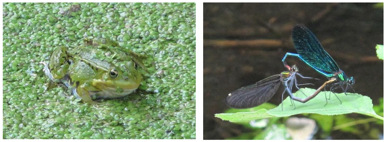
Green frog/ Beautiful demoiselle

from riverside wetlands. The same species become food for whole groups of birds nesting along rivers or visiting them as feeding grounds. Also bats come to the rivers at night to hunt quietly.