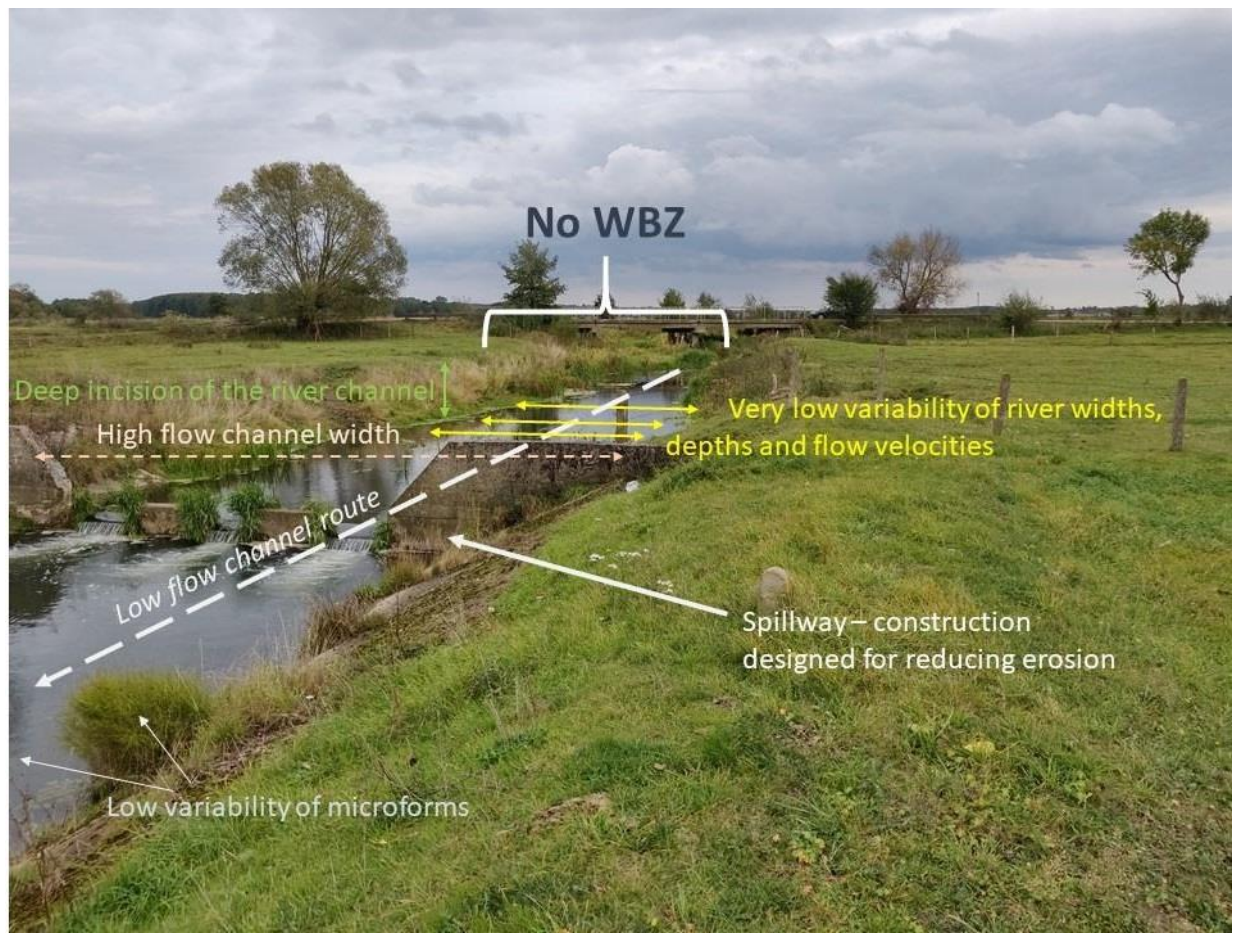
Agricultural river in Poland in the 21st Century and the analysis of particular morphological features of the riverside lacking a WBZ (River Ślina, NE Poland)

Changes in the hydromorphology of rivers described above have affected local and regional hydrological conditions in several ways.