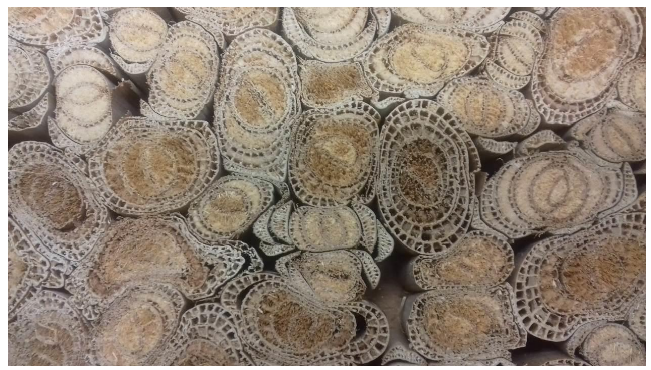
Cattail insulation material

2. Building material – during the last years, the demand for sustainable, health- and environmentally-friendly building materials increased steadily. Building material from wetland biomass meets these requirements. Due to their morphological characteristics, common reed and cattail show extremely good insulating properties. Common reed has been used for centuries as roof thatch on traditional houses that are common all over the world and is increasingly popular also in the construction industry for the lodging and luxury real estate sectors. The 'Thatcher's Craft' was recognised by UNESCO as an intangible cultural heritage in 2014. Currently, e.g. Netherlands, Germany, UK, and Denmark rely on the import of up to 85% reed thatch from Eastern and South-eastern Europe as well as considerable amounts from China (Wichmann & Köbbing 2015). The use of WBZs for reed thatch production could meet the regional demand.