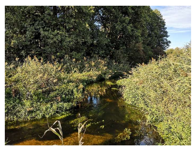
Riparian wetland in the Neman catchment area, Poland (J. Peters).

necessary to rewet drained peatlands, but first of all to protect the intact ones.