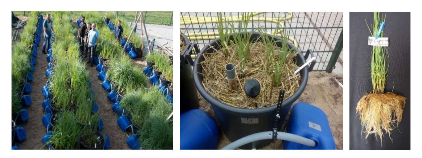
Left and centre: Set up of pots for the trial on peat forming potential of sedges. Right: Carex appropinquata whole plant (above and below ground biomass)