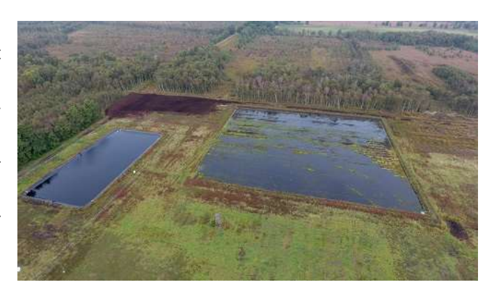
13 From the bird's eye view: the Barver Sphagnum farm flooded after heavy rain

This is exactly what the recently awarded sphagnum farm Barver does: It grows peat moss (Sphagnum) on typical, degraded raised bog grassland. It aims to make paludiculture better known in the region, provide practical experience and contribute to climate protection. The European recognition of Diepholz's peatland protection commitment makes the subject of paludiculture even more visible for the EU institutions. The Barver Sphagnum farm was implemented as part of the CANAPE Interreg project.