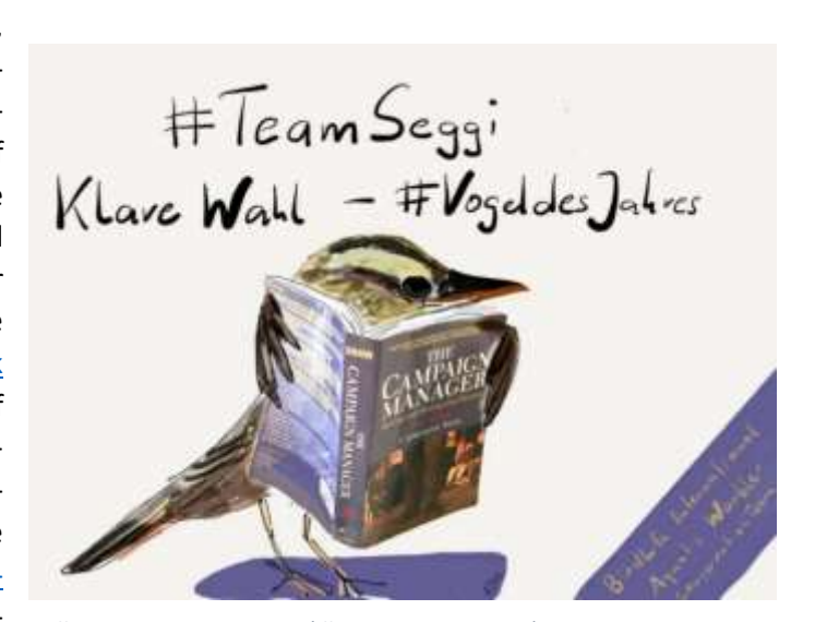
1 Illustration #TeamSeggi

And there is hope: in the past year, Aquatic Warblers were brought from Belarus to Lithuania and resettled there in restored fens. The nomination for "Bird of the Year 2021" would not only give the Aquatic Warbler an upswing, but would also draw attention to peatlands and their importance for climate protection. The Aquatic Warbler Conservation Handbook summarizes the current state knowledge on ecology, habitat management and protection of the Aquatic Warbler. Information is also provided on the website of the Aquatic Warbler Conservation Team (AWTC), which also includes scientists of the GMC.