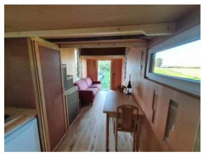
9 right: Cupboard and stairs made of fiberboard made of reed and sedge / wet meadow hay.

10 above: View from the kitchen, on the right small "insulation windows" are visible in the wall