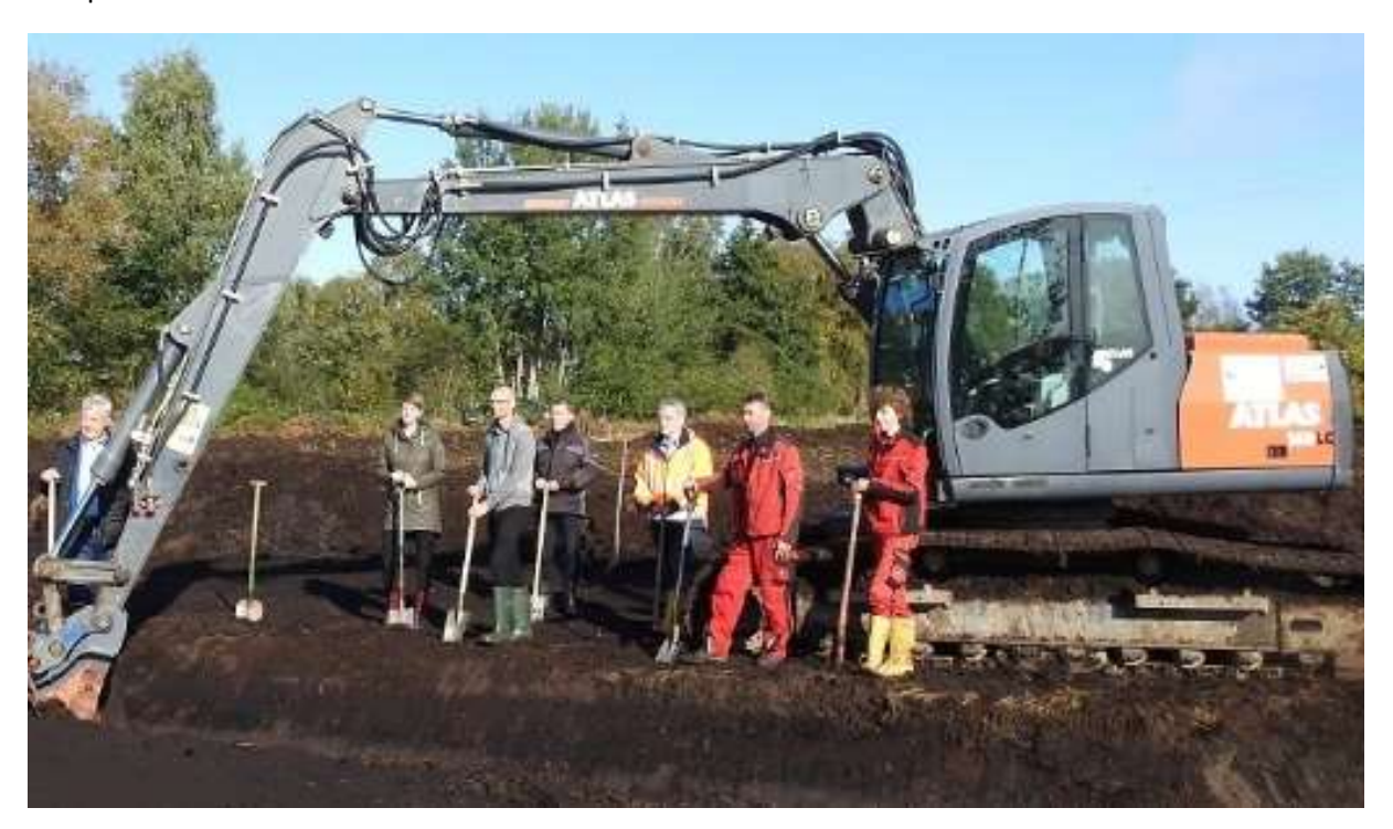
12 Ground breaking ceremony for the paludiculture pilot site in the community of Ganderkesee

From the raw materials - Cattail and Reed biomass - the project partners Jade Hochschule Oldenburg, the Technical University Ostwestfalen-Lippe, Floragard Vertriebs-GmbH and the 3N Kompetenzzentrum e.V. develop products such as insulation materials and peat substitutes and test them in practice. Currently, a ca. 300 m long polder dam with a ring trench is being built for the pilot plantation. Photovoltaic systems provide electricity for the water pump. A weather station will be built next to the test pole.