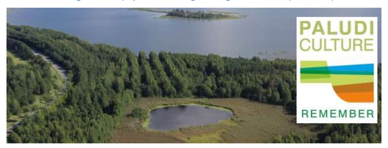
2 Naroch Lake in the Memel catchment area

The role of emergent macrophytes in reducing the biogenic load on aquatic ecosystems