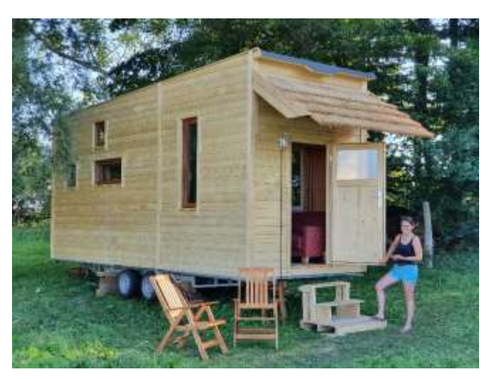
8 The tiny house is ready for visitors and guests

In the tiny house, Alder is in the panels of the interior wall cladding and in the solid kitchen worktop. Reeds are used to cover the canopy roofs, for wall insulation as insulation panels in the form of bundles from Reed stalks (both from the Hiss Reet company) and in the fiberboard of the cabinet (Zelfo Technology). Cattail is used in different forms as insulation material: 1) pure seed wool as blow-in insulation, 2) blow-in insulation from the whole plant (leaves, cobs, stems) prepared by the company Hanffaser Uckermark and 3) Typhaboard panels manufactured by the company Typhatechnik. For